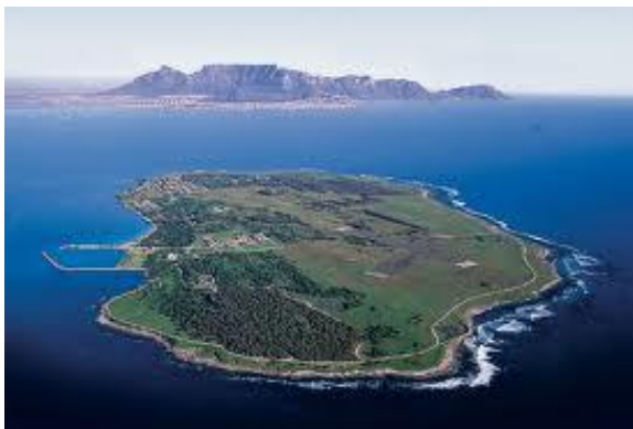
Table Mountain is known for its rich biodiversity and is home to over 1 500 species of plants (more than the number found throughout the entire British Isles), most of them fynbos , which forms one of the world's six plant kingdoms all on its own. At its highest point, Table Mountain reaches 1 085m (3 560ft) and affords views all the way to Robben Island and beyond.

Lunch is included in this tour but supper is not .